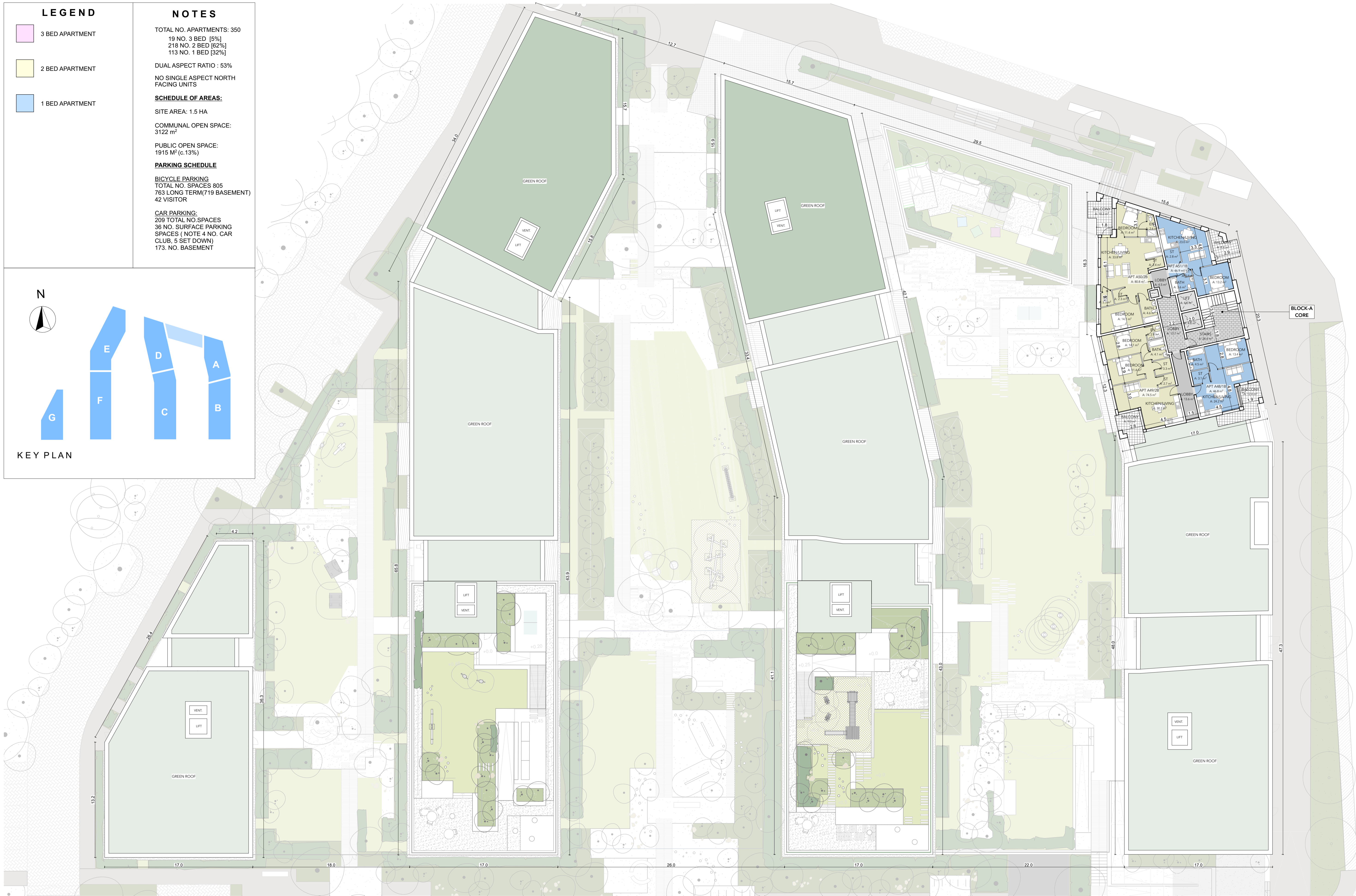
Eleventh Floor Plan SCALE : 1:200